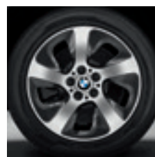
17" Turbine style 561, BMW EfficientDynamics