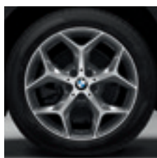
18" Y-spoke style 569