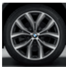
19" Y-spoke style 511