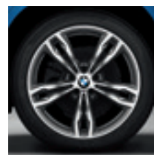
19" M Double-spoke style 572 M, Bicolour