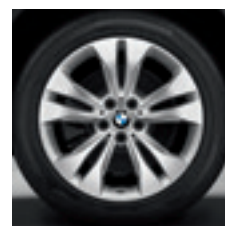
18" Double-spoke style 567