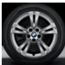
17" Double-spoke style 385