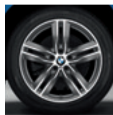
18" M Double-spoke style 570 M, Bicolour