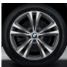
18" Double-spoke style 568