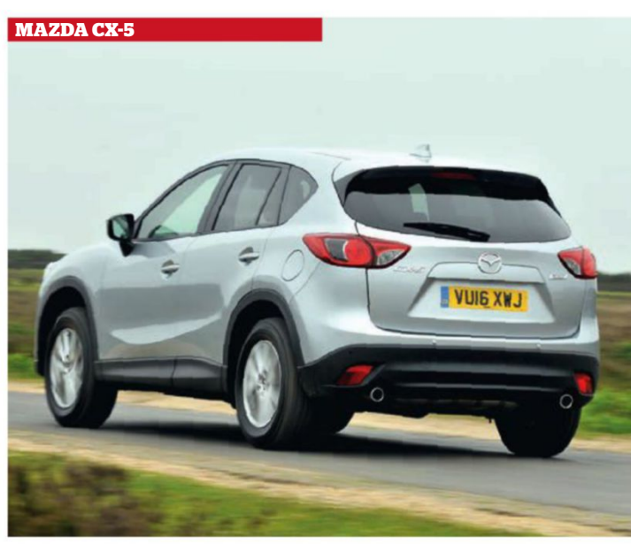
CX-5 isn't as good to drive as its newer rivals, but is far from terrible