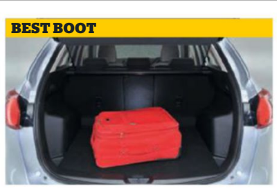
The CX-5 has the biggest boot with the widest opening. Handles on wall of boot allow you to drop rear seats easily