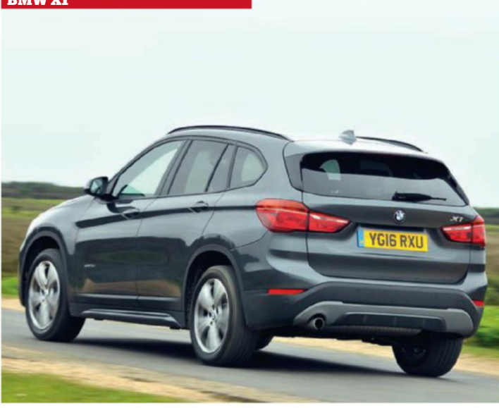
X1 is the most agile through corners. Pity there's so much road noise