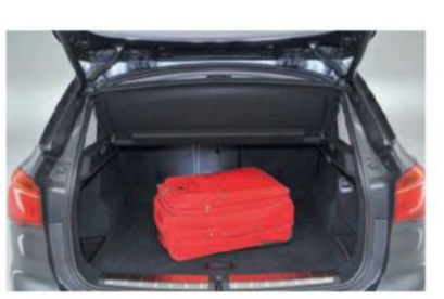
X1 has the shallowest boot, but there's plenty of underfloor storage. Rear seats slide back and forth and recline