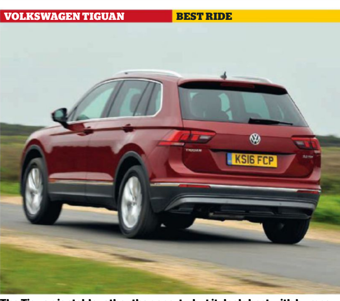
The Tiguan is stable rather than sporty, but it deals best with bumps