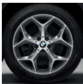
18" Y-spoke style 569